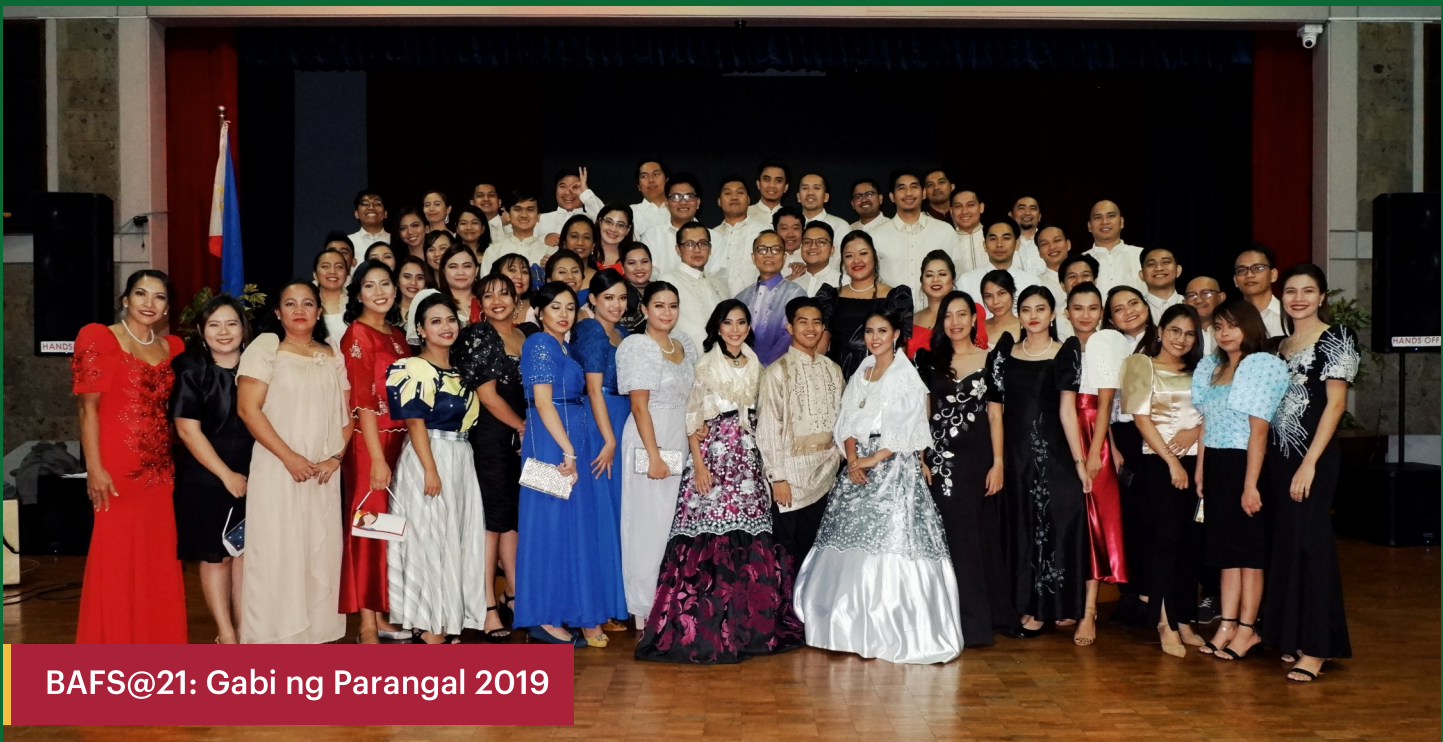
BAFS@21: Gabi ng Parangal 2019