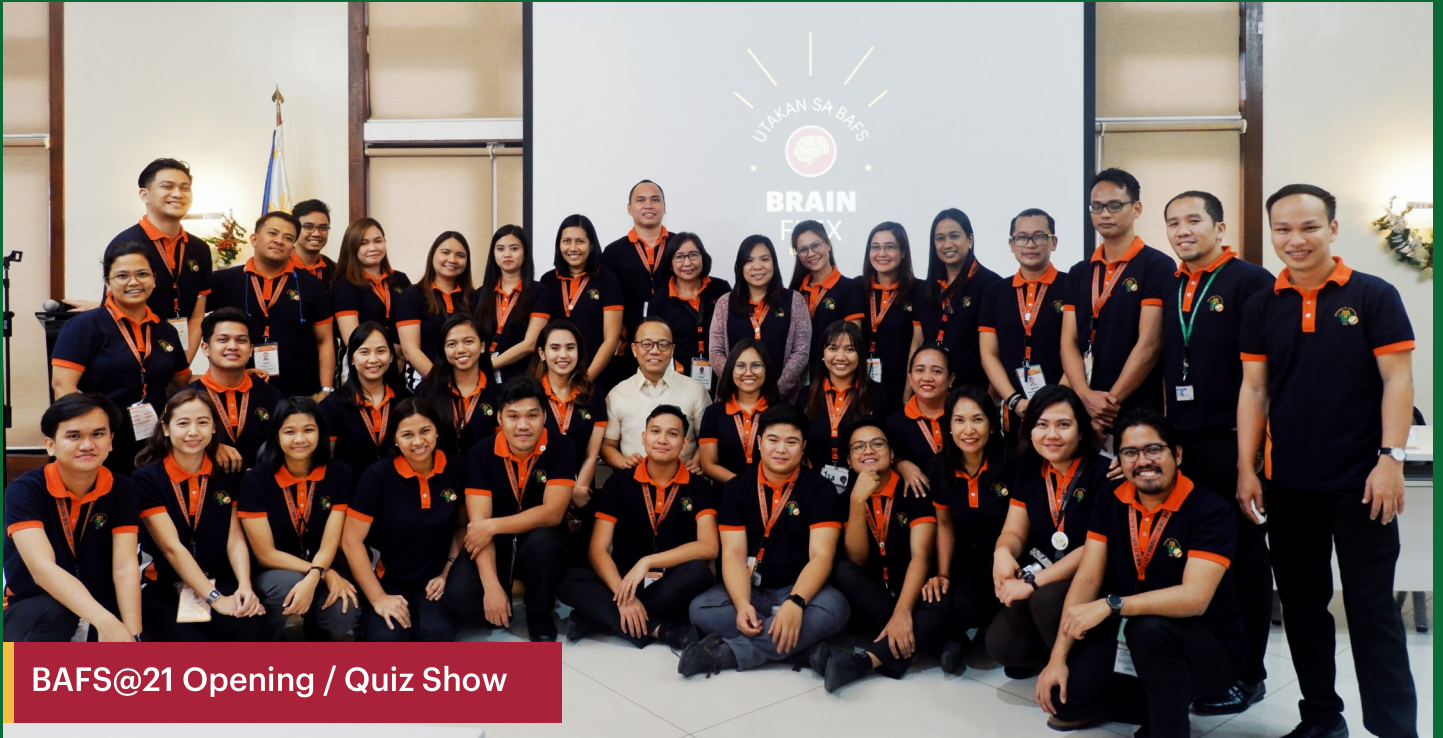
BAFS@21 Opening / Quiz Show

Execute support office operations including human resource management, planning and budget, procurement, information management and general services which are critical to the effective and efficient operation of the Bureau